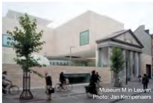
Museum M in Leuven