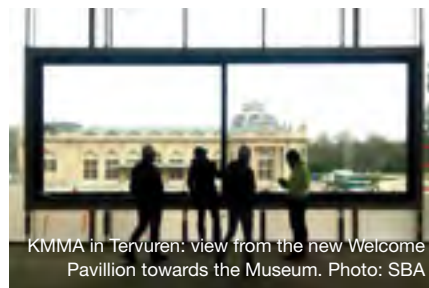
KMMA in Tervuren: view from the new Welcome Pavillion towards the Museum.