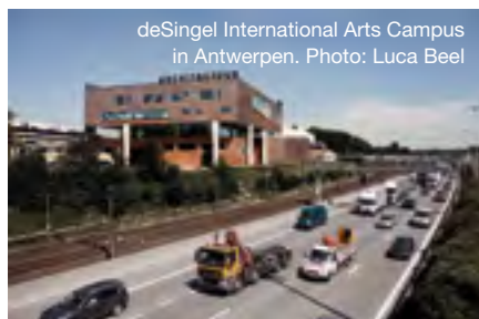
deSingel International Arts Campus in Antwerpen.